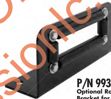
P/N 9939.0004 Optional Roller Mounting Bracket for the SCR 10-17-19 reel