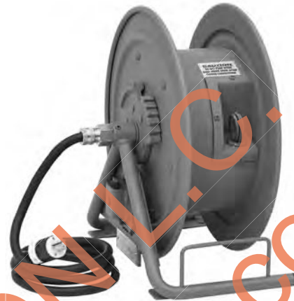
Standard Configuration shown