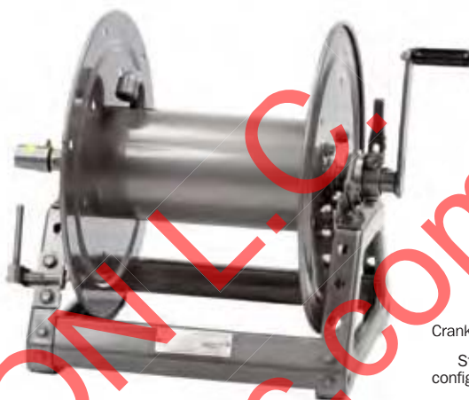
Crank rewind Standard configuration shown