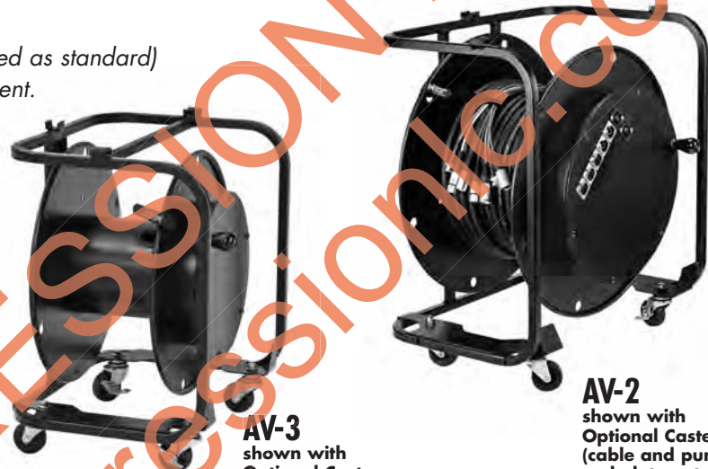
AV-3 shown with Optional Casters