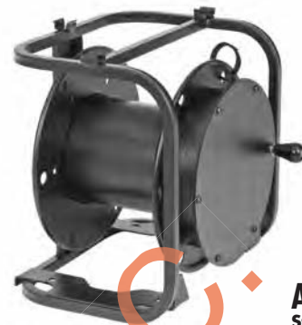
AV-1 Standard with Caster Mounting Plates