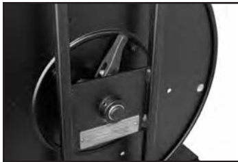
Cam-lock shown on AV-2